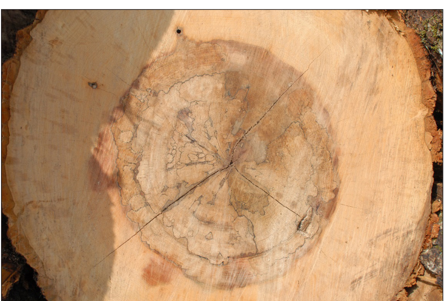
Figure 17. Log with split. If this split doesn't widen too much when the log is cut, it would probably be plated with a gang nail plate and could make an excellent tie.