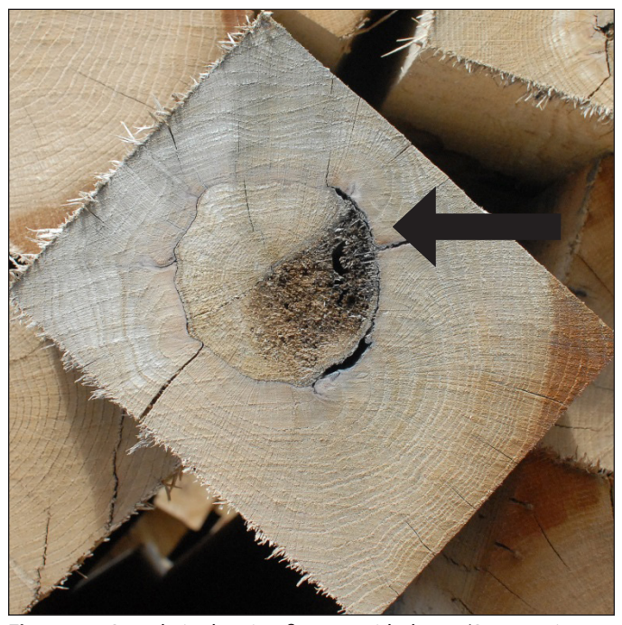
Figure 10. An oak tie showing fire scar with decay. (Arrow points to the tip of the fire scar).