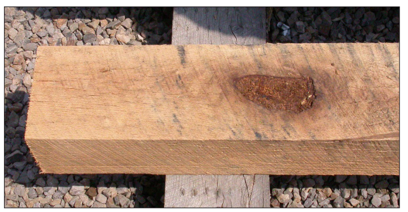
Figure 8. A large rotten knot caused this tie to be culled.

Sometimes there's a hole on the end of the log, and you often have to probe it to know just how far it goes. If you have a log with a deep hole, don't bother sending it to a tie mill because it will be culled. See how far one hole went, and what its effect was, in Figure 11. (I've run a tape measure as far as 5½ through an 8' log, so holes can go quite a ways.)