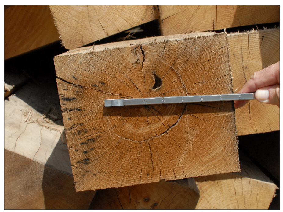
Figure 21. The shake in this 7" x 9" oak crosstie measures 4" across, making this an IG tie. If it were 3" wide or less it would have made a grade tie, because the shake doesn't appear to come to within 1" of any surface.