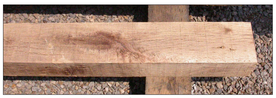
Figure 12. A large knot in the RBA was sufficient to reject this tie.