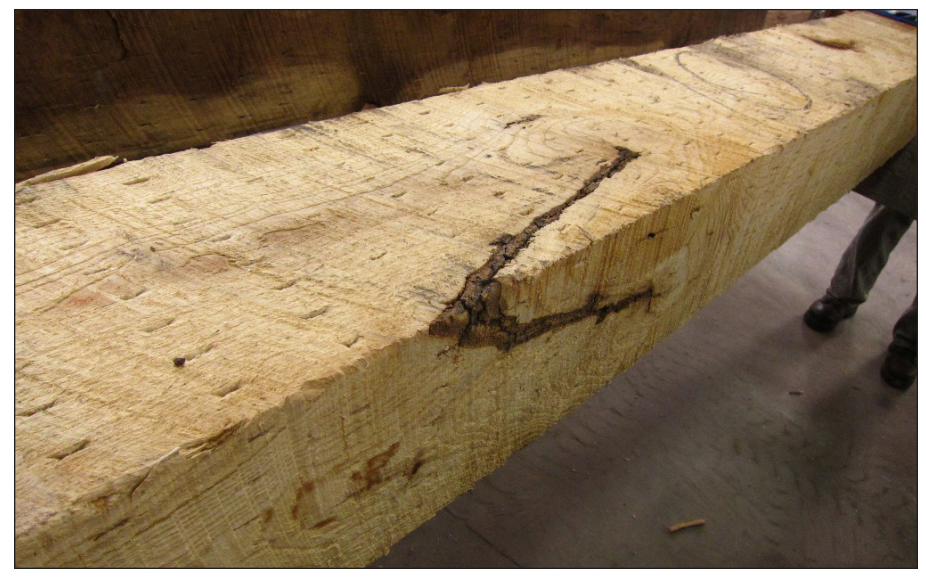
Figure 15. Bark seam in a tie due to a branch.

Splits can come about with seams in trees as two trunks grow together, or they can occur as a result of growth stress release or felling damage. Regardless of the cause, bad splits are a problem. If a split goes from one side of a tie directly across to the other, and if it isn't too long, then the treating plant will probably try to salvage that tie for use by putting a gang nail plate on the end of the tie ("end plating"). For a Grade tie, splits in a green tie (log) are limited to being no more than 1/8" wide and/or 4" long (Figures 17 and 18). (Don't measure the length of a split on the end of the tie.) Some railroads may be slightly more liberal in what they will accept, so consult the local tie buyer.