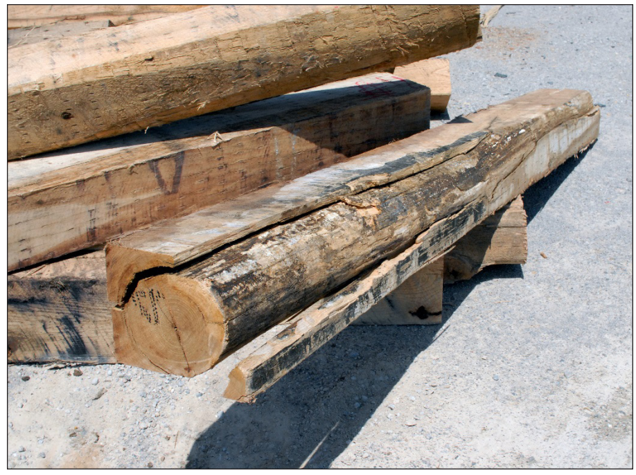
Figure 20. Shake can run the entire length of a log.