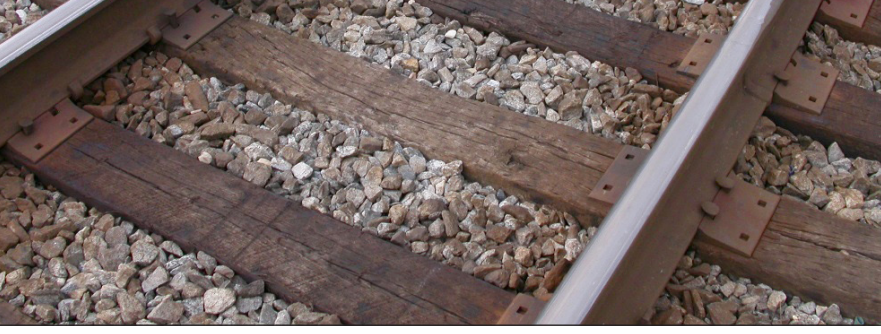
Figure 1. Section of railroad track used to move freight through Lexington, Kentucky. This track uses wooden crossties.

The pieces of wood that hold the two steel rails at a fixed distance (gauge) are called crossties , and the longer pieces that support two or more sections of track as they cross or diverge from one another are called switch ties . Both crossties and switch ties are needed for railroad track, though switch ties are more difficult to obtain because they are longer pieces of wood. Ties have to be strong enough to hold spikes and maintain gauge, and they also have to transmit the weight of the railcars through the rock ballast to the ground (see Figure 1). Wood is the most common material used for both crossties and switch ties in North