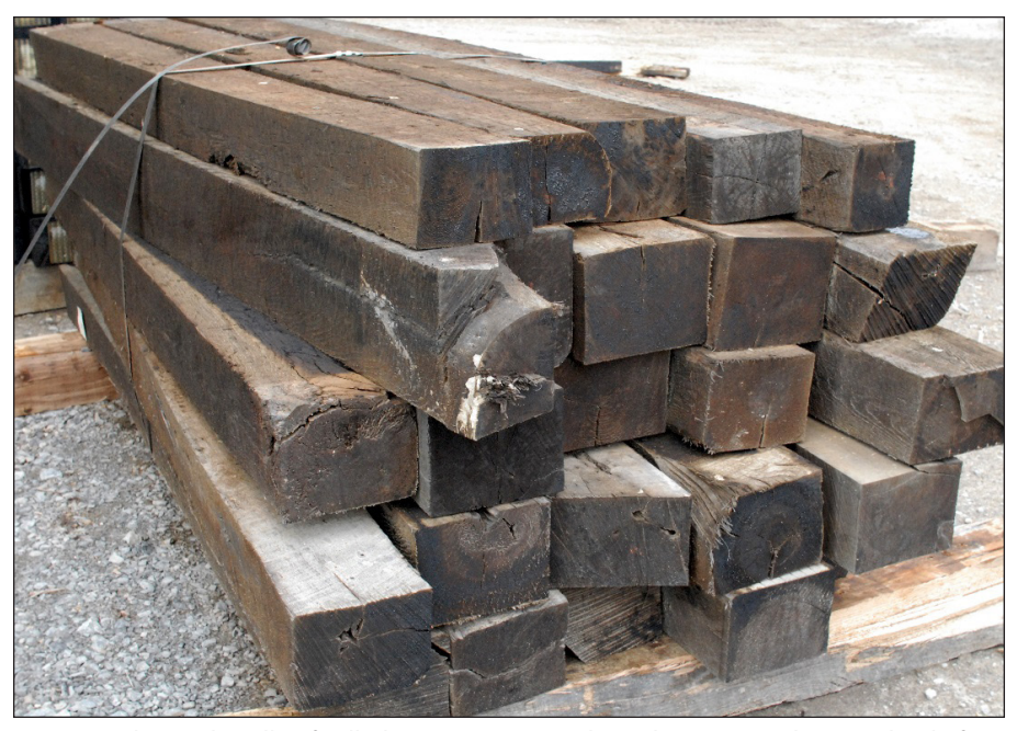
Figure 6. This is a bundle of culled crossties at a tie plant. There's more than one kind of problem shown here, but several ties were apparently culled because they were bucked too short for felling cuts to be removed by the plant's cut-off saws.

be calculated that a sawmill needs a log with a minimum diameter of at least 11.4"inside the bark at the small end to make a 7" \ge 9' crosstie (Figure 7). The minimum log diameter for a 6" \ge 8" tie is 10 inches, and the minimum diameter for a 7" \ge 8" crosstie is 10.7 inches. There's a big problem with these numbers, though – they won't work in the real world. Logs aren't perfectly round, and logs are seldom perfectly straight.