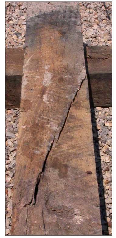
Figure 13. This tie was culled for slope of grain.