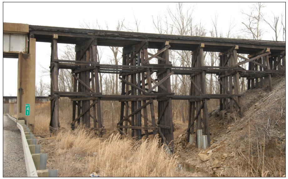
Figure 4. Wooden trestle bridge across the Pennyrile Parkway near Madisonville, Kentucky.

2 Note that the word "poplars" refers exclusively to yellow-poplar (although some railroads feel that yellow-poplar is too soft for their use); "pines" customarily refers to hard pines, but soft pines such as white pines are not excluded. Suppliers need to check with the local buyer to determine which species are accepted.