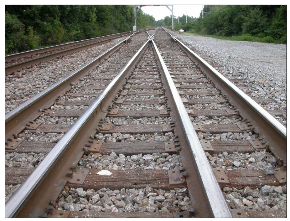
Figure 3. Switch ties are long ties used where two sections of track meet or diverge.

Long timbers with large cross-sections may be in demand for road crossings or bridges, but not as consistently as crossties. Road crossing timbers might be desired in sizes such as 8" x 10" 8" x 12", 10" x 10", or even 8" x 24", and the lengths wanted might be as long as 25'. Check with the sawmill you sell to and find out what is needed. Softwood timbers might be in particular demand for bridge timbers (Figure 4).