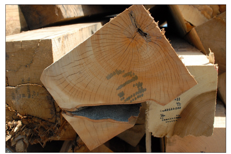
Figure 18. This beech bark seam is essentially a split and can't be saved with an end plate.

Detecting shake. Shake in green logs may not show up until the wood dries out a bit so there's often not a lot that a logger can do to check for this, but keep an eye out for fine separation lines anyway. Elm, soft maple and sycamore are species that are especially prone to shake. When it gets into the treating cylinder, any shake present will only get worse.