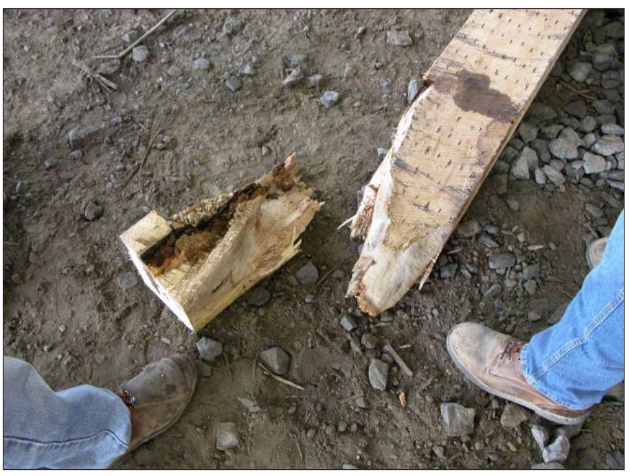
Figure 14. This tie broke when I picked it up. There was a combination of slope of grain and decay here.

Logs or ties that have a significant slope of grain should not be cut for ties, because heavy loads placed on the tie will cause the tie to break very quickly. If you see signs that a log has significant slope of grain (the bark might indicate this), it's probably not worth merchandising for a tie log. Grade ties and switch ties have a restriction of a 1 in 15 slope of grain, and IG ties specifications are only slightly more relaxed (2 in 15). See figures 13 and 14.