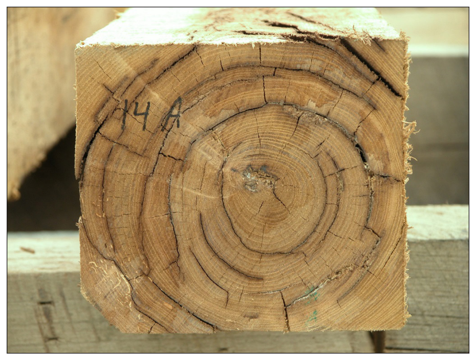
Figure 19. This is an example of really bad shake in a black locust tie.