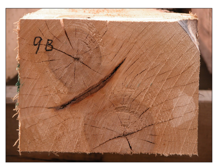
Figure 16. The bark seam in this twin heart hard maple doesn't look like it will extend very far, and therefore it would likely be acceptable.