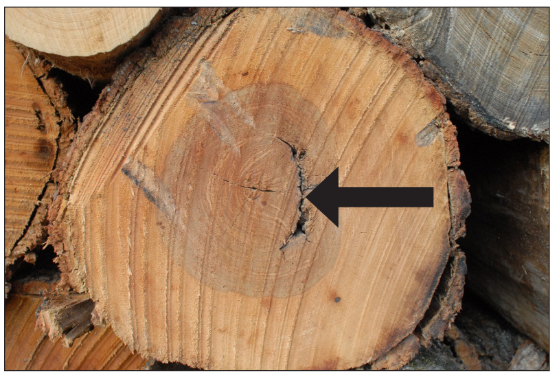
Figure 9. Fire scar in hickory, apparently sound. (Arrow points to the tip of the fire scar).