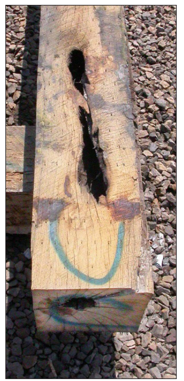
Figure 11. Large holes caused this tie to be culled. Notice how the hole extends from the end of the tie into the RBA.