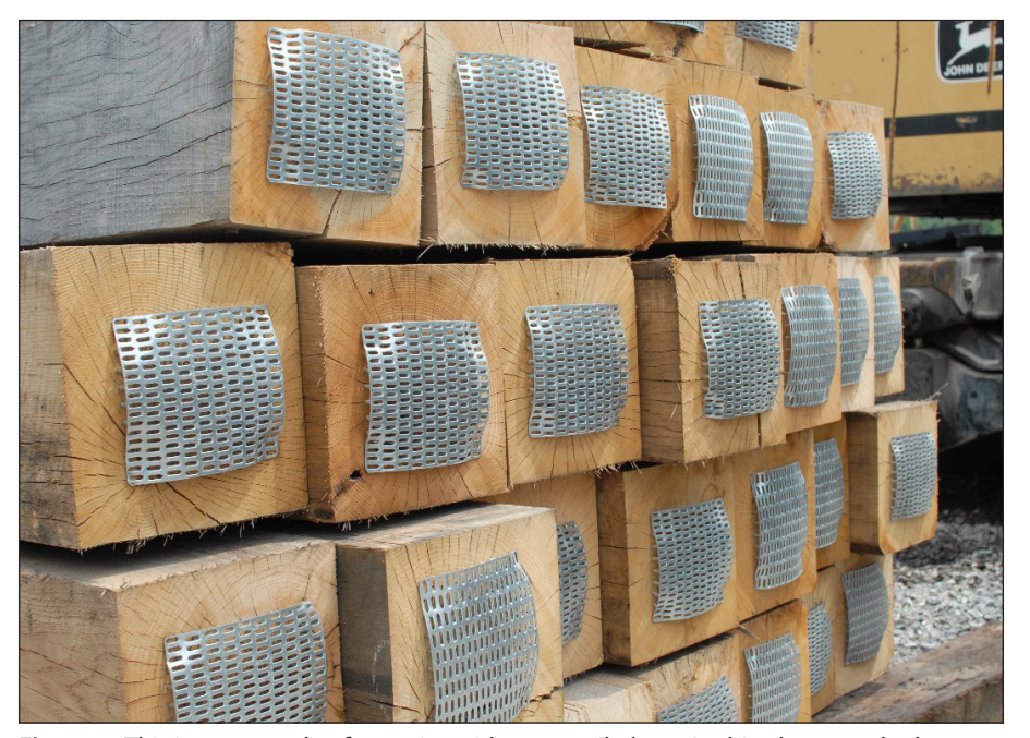
Figure 5. This is an example of crossties with gang nail plates. In this photograph, the plates have been tacked on and they are awaiting hydraulic pressure to seat them to their full depth. If these ends weren't all squarely cut, the nail plates wouldn't seat properly.

As for those long logs, consider what happens when longer logs are brought to