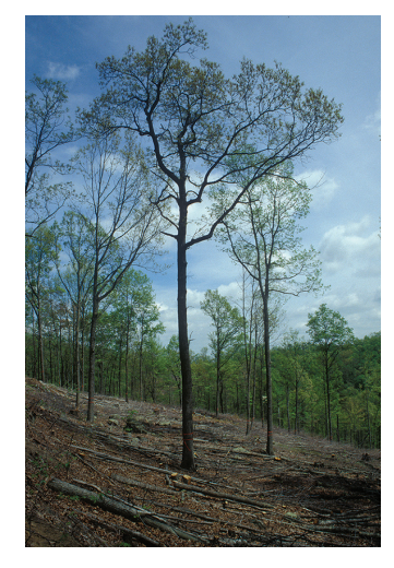
Figure 6: This Two-age Deferment harvest left behind reserve oak trees which will act to "lifeboat" oaks in the stand. Future management will likely be needed to further develop the young oak regeneration.

ested sites. These plantings can be installed by hand or mechanical planting using a medium size tractor to pull a planting machine. Trees are usually planted in rows that are commonly between 6 and 12 feet apart with a similar spacing of trees within each row. Tree plantations are considered to be most successful when a variety of tree species are included within the planting. Species diversity within the plantation ensures the best chance of surviving insect and disease outbreaks, environmental changes, and extreme weather conditions, such as extended droughts or excessively wet or cold springs. Species selection is also important, because every species prefers specific soils and site conditions. Trees properly matched to the planting site have a much better chance of out-growing other less desired com-