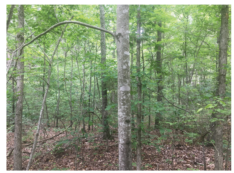
Figure 5: The pole-size tree in the middle of the photo is a red maple. The trees on the far left and right of the photo are white oaks. Removing the faster growing red maple will provide extra space and sunlight, allowing the white oaks a much better chance of becoming mature trees.

Crop Tree Release means releasing the crown of pole and small to medium sawtimber trees by using individual tree herbicide treatments, mechanical treatments such as girdling or felling, or a combination in small diameter stands. In sawtimber-sized stands, a commercial harvest may be possible. The treatment is completed by first identifying crop trees. These are canopy trees that are of good vigor and meet management objectives, which may include providing acorns and habitat for wildlife or potentially being high value timber trees. Once identified, each of the individual crop trees is released by removing neighboring trees whose crowns are touching and impeding the horizontal growth of the crop tree crown. This is called a crown touching release. By releasing these crop trees on at least three sides, diameter growth rate will vastly improve as the crown of the croptrees can expand into the newly opened space. This treatment will not only increase the diameter and volume growth of the released oaks, it also ensures that oaks maintain a dominant canopy position. This practice