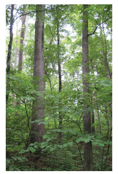
Figure 1: A managed white oak stand.

Maintaining healthy oak forests often means ensuring that oaks continue to regenerate seedlings and saplings and existing oaks have room to grow. Even in forests where the number of oak seedlings and saplings (advance regeneration) is adequate, ensuring that competing species do not eventually reduce their growth or threaten their longevity is still a concern. Management is usually necessary to ensure oak seedlings are present and are able to grow into large saplings capable of eventually reaching the upper canopy of the forest. All of this indicates that oak growth and development is a management concern throughout the life of a forest. Every forest is different and offers specific challenges to oak regeneration and growth depending on soils, topography, history, and management objectives. However, the need to ensure regeneration and continued growth and development is universal. While the different species of oaks generally have the same issues and respond similarly to common oak management practices, these practices can be optimized to meet specific requirements for each species including white oak.