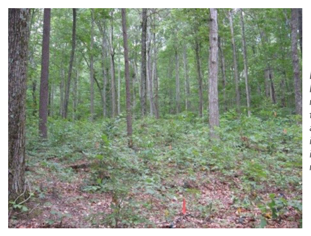
Figure 4: Mid-story removal helps to develop already existing small oaks into advance regeneration.

species like yellow-popular. White oak is a relatively slow grower, even compared to some other oak species, and the development of oak regeneration must be monitored. If it is becoming overtopped after the mid-story removal, further practices to ensure its development may be needed.