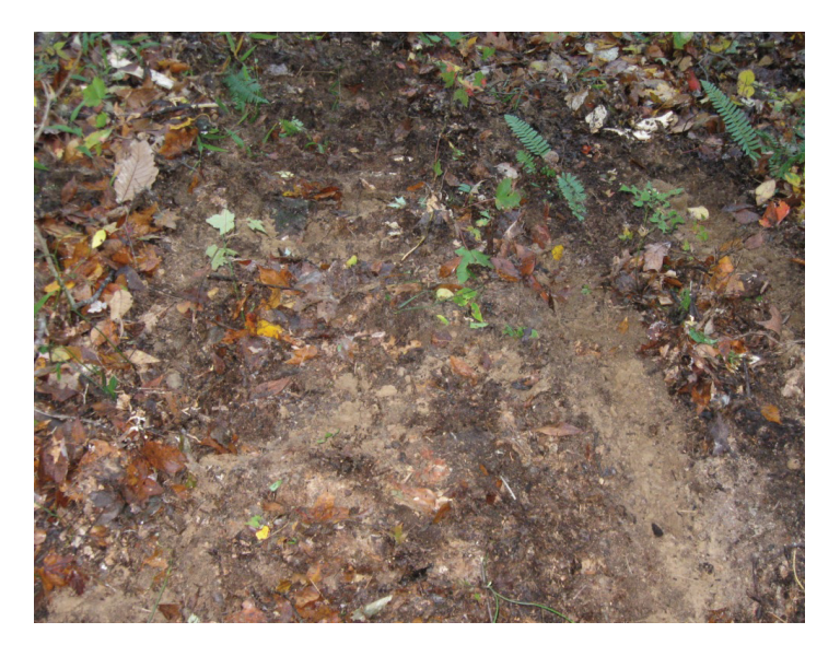
Figure 2: Forest leaf litter before soil scarification (top and bottom).