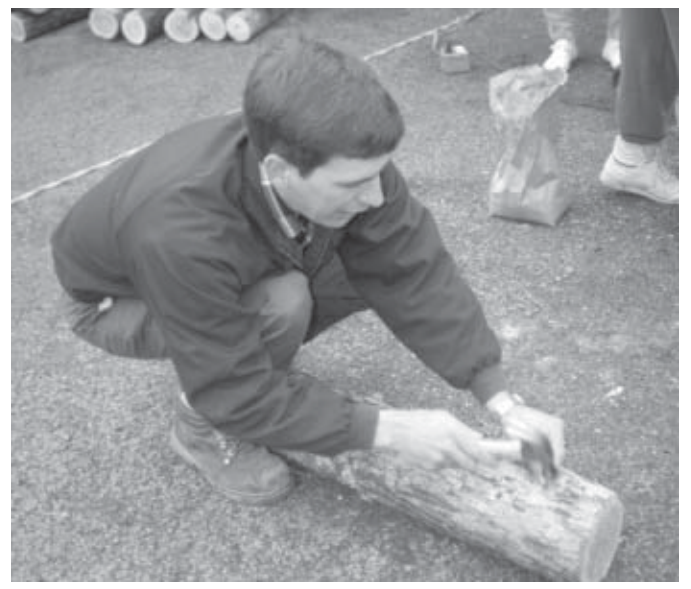
Figure 4. Hammering dowel spawn into shiitake log.

Logs can be stacked several different ways (Figures 6-8) for the incubation period (see FOR-83, Incubation and Stacking ). One of the best stacking methods is lean-to