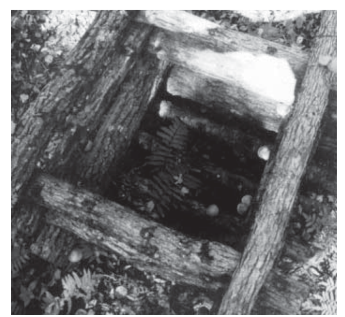
Figure 7. Log cabin crib method of stacking logs.

Ideally, the logs need to have 85% to 90% shade—evergreen shade is usually a little cooler and is present year-round. Our hardwood trees lose their leaves in the winter, and warm days in the winter can dry out unprotected logs. Many spawn strains will produce mushrooms within the first year, some in six months, some longer, depending in part on the time of inoculation (fall/spring). It is wise to test different strains of spawn and different species of wood to see what works best in your particular circumstances. If the weather is particularly dry, the logs should be wetted by soaking them in a container (animal water trough, large buckets) or by short-term, heavy overnight sprinkling every few days in a dry period.