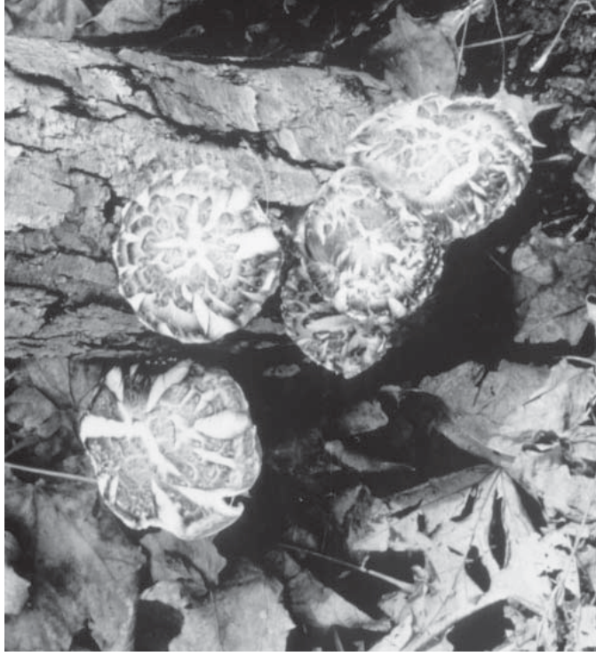
Figure 2. Dark chocolate brown shiitake mushrooms with split caps.