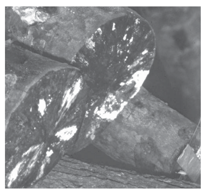
Figure 9. White mycelia showing on ends of incubated logs.

Many things affect the level of productivity, such as climatic conditions, type of spawn, and log species and sizes used, and you need to keep records of the details in your own situation.