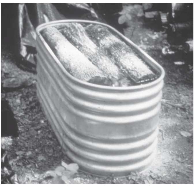
Figure 10. Immersing logs overnight when ready for production. Keep top logs under water.

All crops need a market. Fine restaurants, especially of continental, French, or Asian cuisine, would probably be interested in buying these mushrooms fresh, but try selling them to your local pizza parlor, too. Health food/natural food stores and food cooperatives may also be interested in buying locally produced, fresh mushrooms. Shiitake are well enough known that they can be sold at farmers' markets. Large supermarkets are usually only interested in buying produce in large volumes on a regular