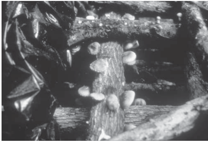
Figure 1. Honey-colored shiitake mushrooms on logs.