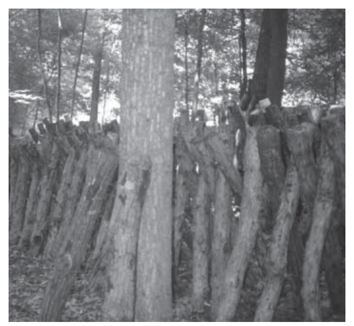
Figure 6. Teepee method of stacking logs.

(Figure 8), where the logs are laid close to the ground, but on a clean surface such as gravel, not directly in contact with the soil. Other stacking methods include teepee stacking (Figure 6) and log-cabin stacking (Figure 7), where the logs are stacked higher off the ground. Placing the logs on a gravel bed (which could be laid down over fabric) and up on two or more base logs, or a recycled pallet will make it easier to keep water (and therefore good conditions for contamination) off the bottom logs. Logs should be moved around within the stacks several times during the incubation period. If mold appears on the logs, the logs need to be re-stacked more openly to improve air circulation so that further mold growth will be discouraged.