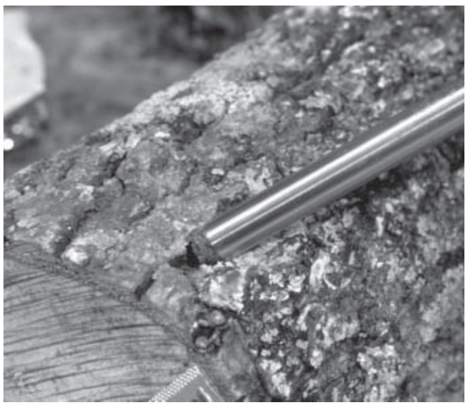
Figure 5. Injecting sawdust spawn into shiitake log.