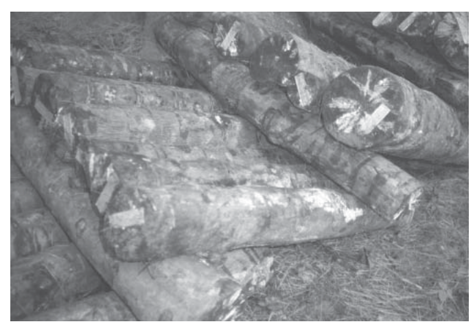
Figure 8. Lean-to method of stacking logs.

After several months when you see the white mycelia of the fungus on the ends of the logs, indicating that the spawn run is complete (the fungus has occupied the entire log)(Figure 9), you may want to soak them overnight to encourage fruiting (Figure 10). Doing this repeatedly and allowing a minimum of eight weeks between fruitings is known as forced fruiting and has the advantage of controlling when you will have mushrooms. After soaking, the log stacks can be covered with plastic while the mushrooms are beginning to emerge (see FOR-85, Harvesting for greater detail). The cover can be removed to harvest the larger mushrooms and then replaced while the smaller ones are growing over the two- to three-day period of fruiting. If you do cover the logs with plastic, be sure to cut an air vent hole in the top, and leave a space at the bottom so