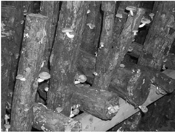
Shiitake mushrooms growing on logs