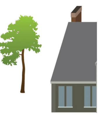
feet up and trim any overhanging branches to prevent fire from transferring to your roof.

propane tanks should be removed. Leaf litter and debris should be removed from gutters and off roofs. Plants should be pruned back, including any large trees near the house. so that no branches are within 10 feet of the house. Any tree that overhangs any part of your home Prune trees from the ground to 10 (roof, porch, deck, and chimney) should be trimmed back to prevent fire from