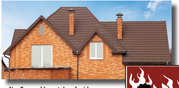
Nonflammable metal roofs aid in creating a Firewise home.

This factsheet focuses on creating defensible space around your home to slow or halt an advancing wildfire. (If you're interested in ways in constructing a Firewise home, such as safer building materials and construction methods, you can review the references on the back of this factsheet.)