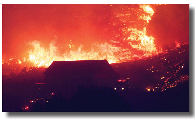
Build defensible space before your home is in danger. Be proactive so you are prepared when wildfires threaten your home.

ance. The driveway should be in overall good shape and able to support a fire truck. Your address should be visible from the road; large reflective tape numbers can be used on your mailbox or post.