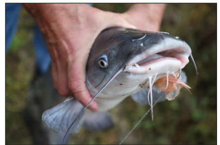
The Kentucky Department of Fish and Wildlife Resources regularly stocks catfish as well as other fish species in 44 lakes across Kentucky as a part of the Fishing In Neighborhoods (FINs) program.