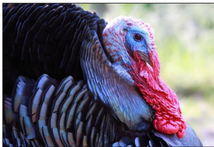
A male turkey ( Meleagris gallopavo ) in strut. During the mating season the male's strut to show off their feathers in a courtship display. A male's head is distinct with blue and red colors and lacks feathers.