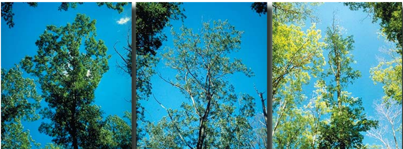
Good, fair and poor crowns (left to right) of northern red oak used in determining susceptibility to mortality from gypsy moth defoliation.