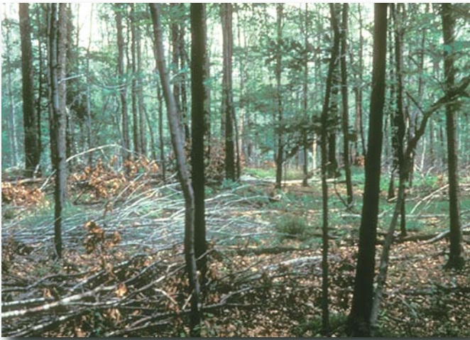
Thinning and TSI harvest in a gypsy moth-infected stand.

for conifers or conifer-hardwood mixtures after harvest on poor sites.