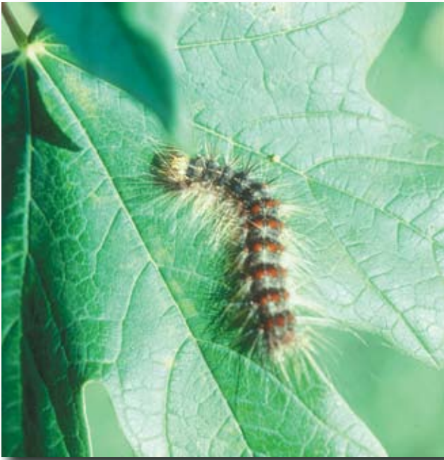
Gypsy moth caterpillars can be identified by their long hairs and red and blue spots.

factors are expected to promote heavy gypsy moth defoliation if and when gypsy moths become established in the area. With increases in population, the moth will disperse and affect favored trees on the better sites (lower north- and east-facing slopes).