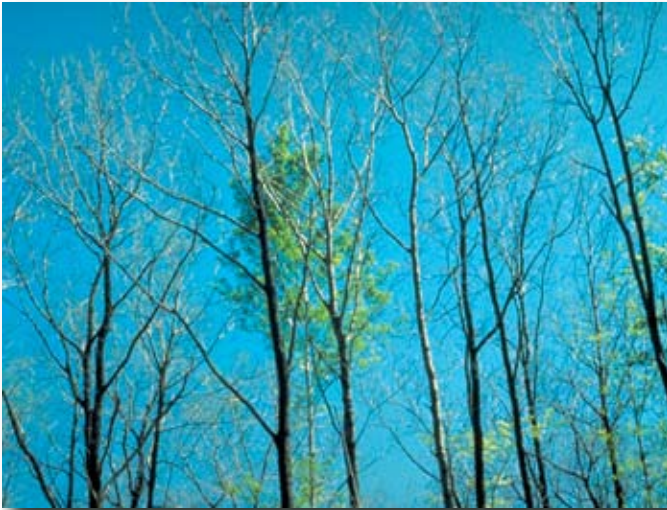
Gypsy moth defoliation of an oak-hickory stand. The foliated tree in the background is a yellow-poplar, a tree that is rarely fed upon by gypsy moth.